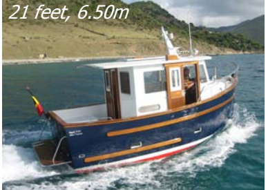
Mayrik P214, Mini Trawler. It will cross the Atlantic, from Saint Martin to La Rochelle in May 2008