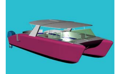
Catamaran, boat-taxi, 36 feet, in construction