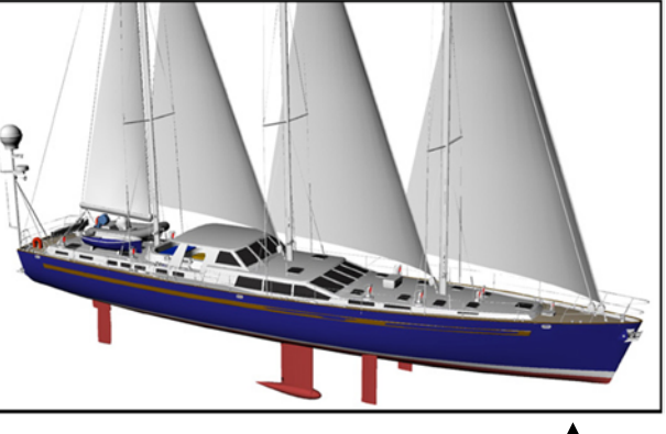
Méga-yacht 28m, project being studied

Mayrik Yacht Design llc, BP 1041, 97061 Saint Martin cedex, French Antilles. Tél : +59.0590.51.94.25 Fax : +59.0590.51.94.26 Cell : 0690 53 69 66 – Web : www.mayrik.com - Email : mayrik@wanadoo.fr Sarl au capital de 8000€, RCS : Basse-Terre 440 018 299 – Siret 44001829900014 – code APE : 351B – Member of Fédération des Industries Nautiques