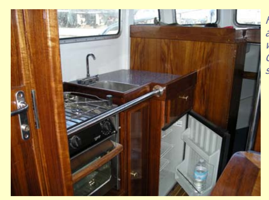
Fitted kitchen, stove with furnace and grill, two fires, refrigerator 85L with compressor, worktop in Corian, hot and cold water with a sinkmade of stainless steel.

Front cabin with two bunks separated, or double bunk on starboard.