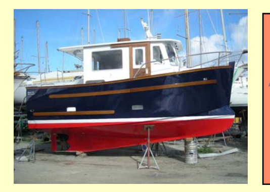
The impressive and last for ever proofed Perkins M92B, added with the Autoprop oropeller, as with a technology intended to reduce the consumption from which all the range profits, is very economic in fuel oil. (3,6 L/H with 5,6 knots)

to propose boats to live, in various models, all extremely comfortable, sea-worthy, durable, economic and sure with use.