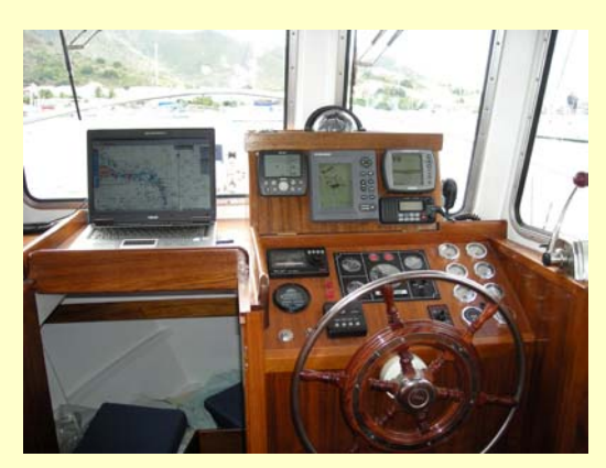
Wheel, engine and control panels. It still remains of the place for your computer. On the left, a large charts table with arrangement.