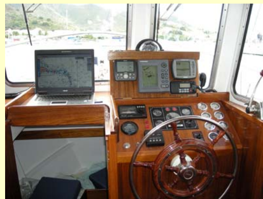
Wheel, engine and control panels. It still remains of the place for your computer. On the left, a large charts table with arrangement.