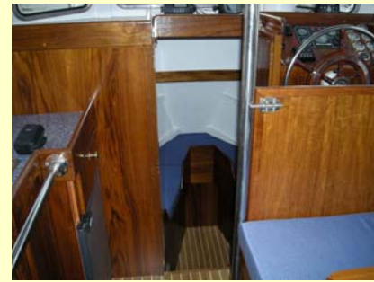
Front cabin with two bunks separated, or double bunk on starboard.