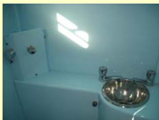
.Bathroom with electric toilet, shower with cold/hot mixer valve, wash-hand basin.