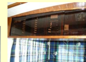
Electric control panel with automatic circuit breakers.