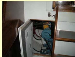
Ladder and engine access, front cabin. After removal of the ladder, one can open a second door. A trap door of floor in the saloon also gives access to the engine room. One will note "bedside tables" to the head of the bunks.