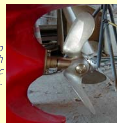
The Autoprop propeller with automatic adjustable pitch.

The goal of our company is to propose boats to live, in various models, all extremely comfortable, sea-worthy, durable, economic and sure with use.