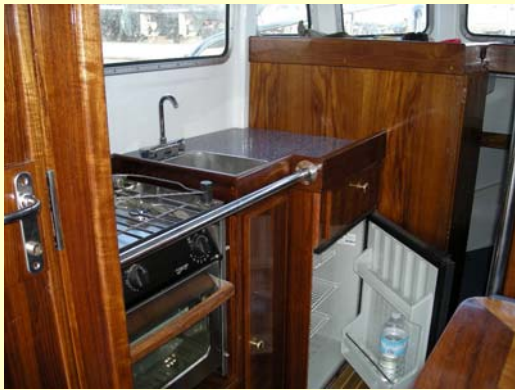
Fitted kitchen, stove with furnace and grill, two fires, refrigerator 85L with compressor, worktop in Corian, hot and cold water with a sink made of stainless steel.